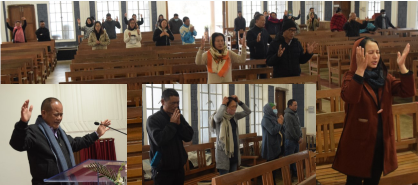
On February 2, 2021 (Tuesday) the CTC families had a prayer fellowship, dedicating the whole campus and also for the safe arrival of the students.