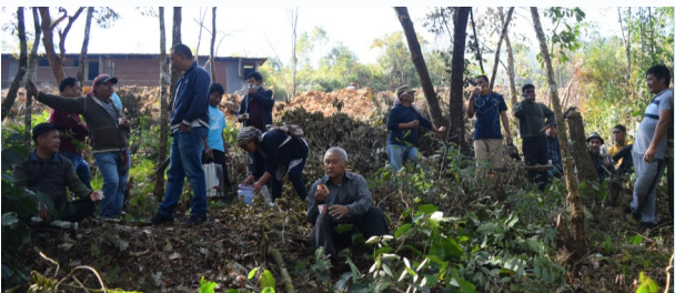
On February 4, 2021 (Thursday) CTC Faculty and Staff members cleared the jungle for the Coffee Plantation and also build house to start the Poultry Project.