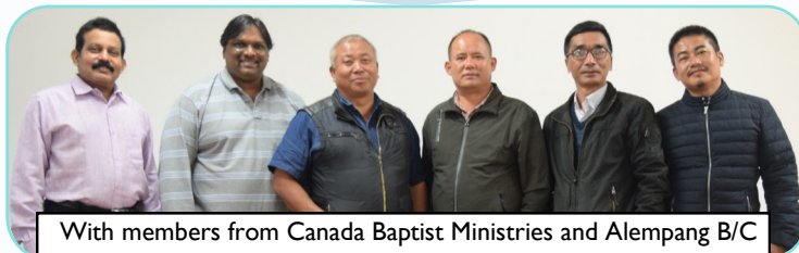
With members from Canada Baptist Ministries and Alempang B/C