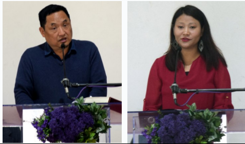
Joining the rest of the world, the CTC community celebrated the INTERNATIONAL WOMEN'S DAY on March 8, 2021 (Monday) at the Multi-purpose Hall.