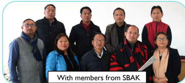
With members from SBAK