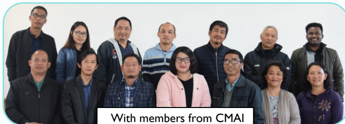
With members from CMAI