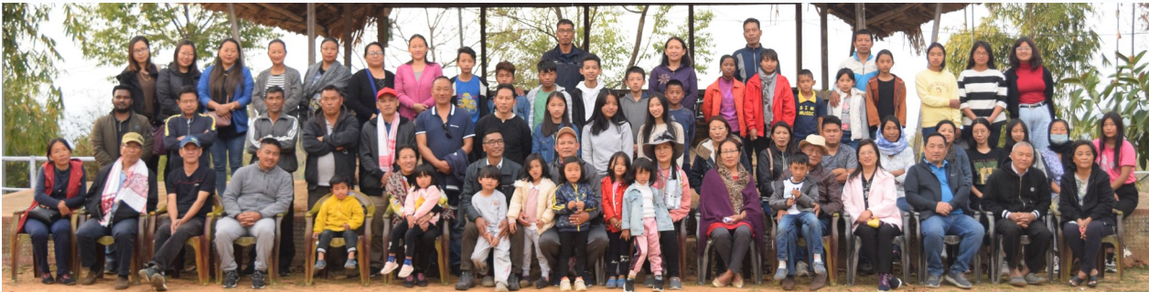
CTC Faculty, Staff and family Picnic at Just A Venue on February 20, 2021 (Saturday).