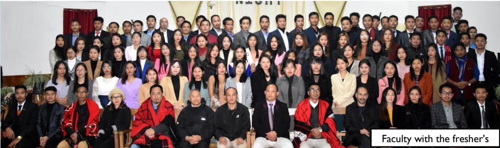
Faculty with the fresher's